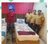
Bed Making Competition