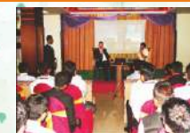
Le Royal Meridien, Abu Dhabi