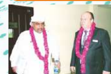
Madinat Jumeriah, Dubai