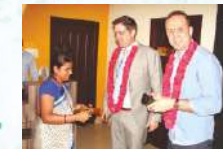
Shakespeare & Co, Dubai