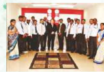
Jumeirah At Ethihad Towers, Abu Dhabi