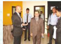
Waldorf Astoria Palm Jumeirah, Dubai