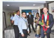
Atlantis The Palm, Dubai