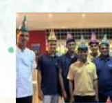
Celebrations of Birthday's & 100% Attendance