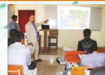
Rixo's Bab Al Bahr Ras Al Khaimah, UAE