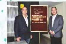
Royal Mirage, Dubai