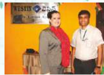
Sheraton Dubai Creek Hotel & Towers